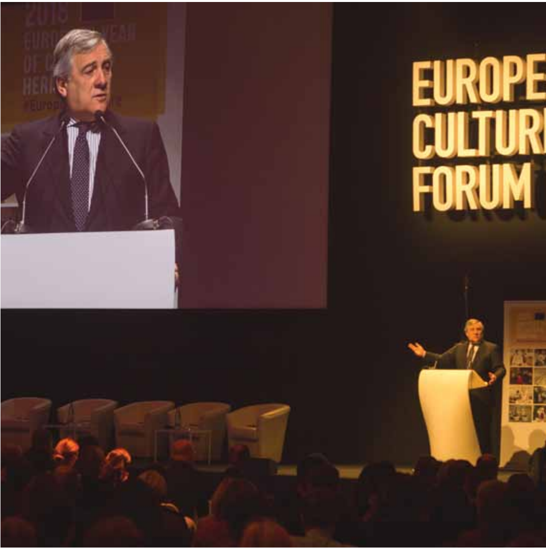
Antonio Tajani, President of the European Parliament.

From above: Jean-Claude Juncker, President of European Commission; Dario Franceschini, Minister of Cultural Heritage and Activities and Tourism of Italy; Giuseppe Sala, Mayor of Milan; the crowded conference room during Tibor Navracsics' speech, European Commissioner for Education, Culture, Youth and Sport; overview of the exposition on the world Cultural Heritage: the relaxing moment with the final dance; Superstudio's led wall to communicate the event from outside.