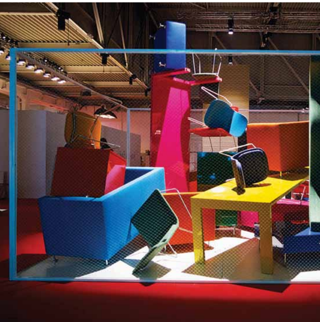
Year 2000: Installation by Giulio Cappellini at Superstudio Più.