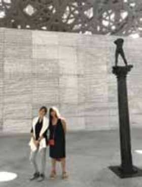
The Abu Dhabi Louvre by Jean Nouvel.